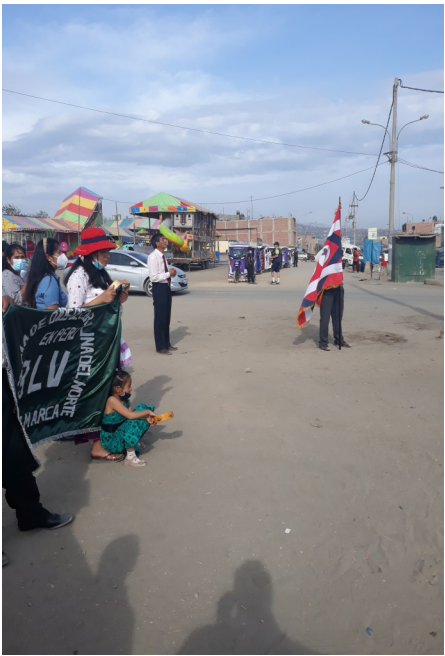
CHURCH MARCHING DOWN THE STREET IN THE CITY OF LEMA, PERU