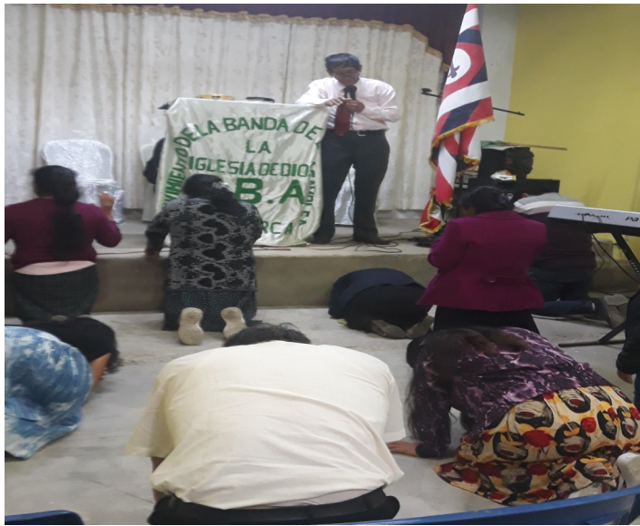
INVITATION TO COME AND PRAY GIVEN AT THE NATIONAL CONVENTION