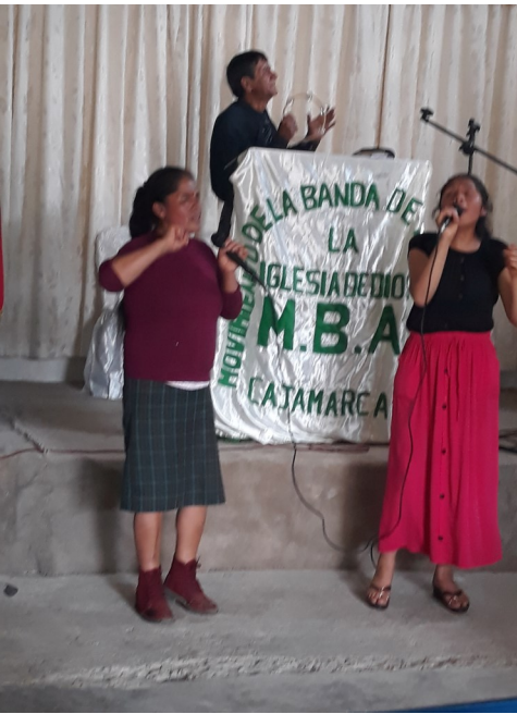
LEADING IN WORSHIP DURING THE PERU NATIONAL CONVENTION