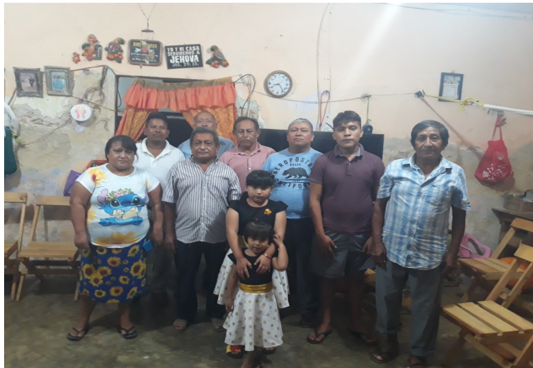
The first two pictures below are at two of our churches in Mexico. The third picture shows a few of the saints that were gathered at the ocean for a baptism. Several more were in attendance that are not pictured.